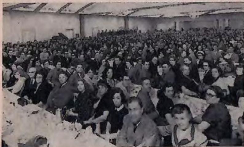
Here are part of the 1,300 who attended the Twin Cities Chapter Saturday morning breakfast meeting in Minneapolis when William Branham was the principal speaker. The first meeting of the Twin Cities Chapter was attended by fifteen persons. This is the result of Love and Unity in the Lord!

heart to them of our hunger to see great things accomplished for the Lord.