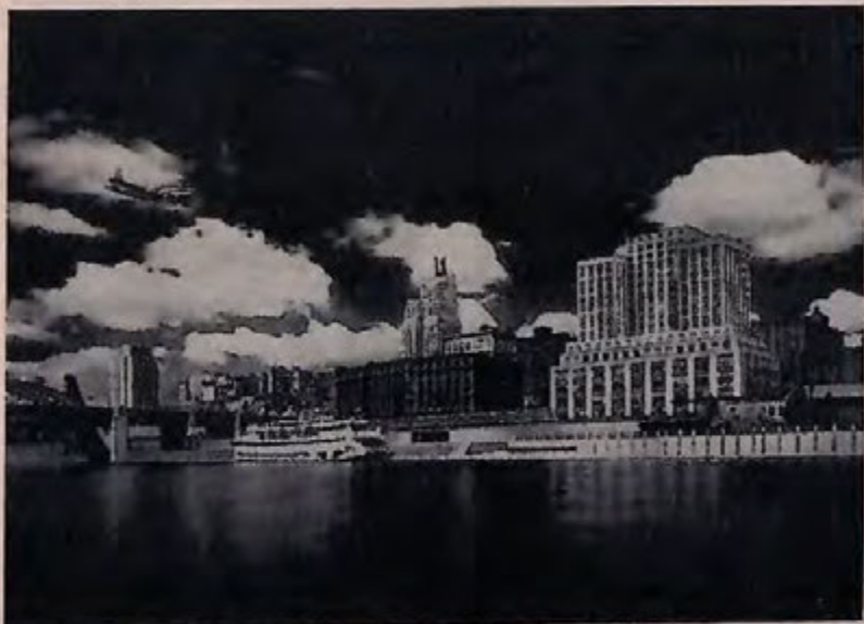
shows the Saint Paul skyline from the Mississippi River. The Twin Cities Chapter of FGBMFI is composed of business men and ministers from Saint Paul and Minneapolis. Full Gospel Churches of both cities fully co-operate.

ahead on this plan as an integral part of our future activities and policy because of a wonderful break recently in a city of parallelling drastic conditions to that of our Twin City area. This city was Milwaukee. The directors went to Milwaukee with one purpose, directed of the Lord, to arrange for a Monday breakfast with the pastors of the city following a revival of Oral Roberts.